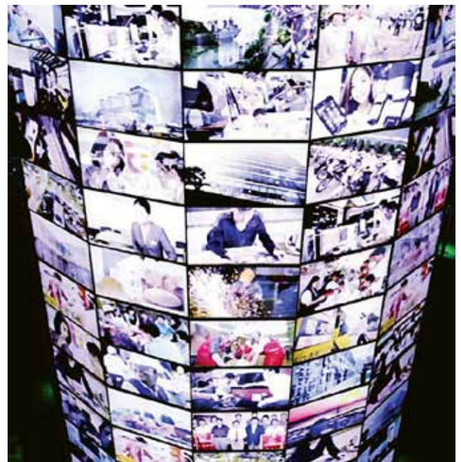
Figure 1. Eye-catching video walls enable businesses to publicize their goods or services.