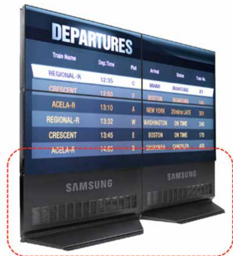
Figure 9. Floor stands and expandable wall mounts provide various custom configurations to fit almost any need.

Versatile installation accessories, such as a floor stand, a mobile Internet device (MID) and wall brackets, are some of the versatile installation accessories that provide even more display options. Using this modular approach also enables company owners and managers to find the exact Samsung LFD to fit their needs cost-effectively.