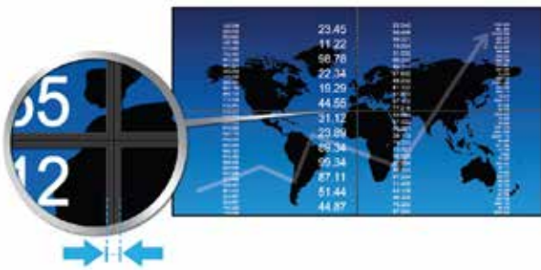
Figure 2. Narrow and ultra-narrow bezels help create a near-contiguous video wall.

The UDC, UDC-B and UEC Series displays feature narrow and ultra-narrow bezels for near-seamless video walls. The UDC and UDC-B models have an ultra-narrow bezel-to-bezel width of 5.5 mm (0.22 in.). The UEC model has a narrow bezel of 11 mm (0.43 in.).