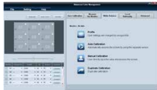
Figure 4. The enhanced color calibration UI provides more detailed color management.

Advanced Color Management(ACM) software has also been improved for usability and performance. The calibration attributes are now more extensive and the user interface(UI) easier to use allowing for a more advanced calibration of the displays.