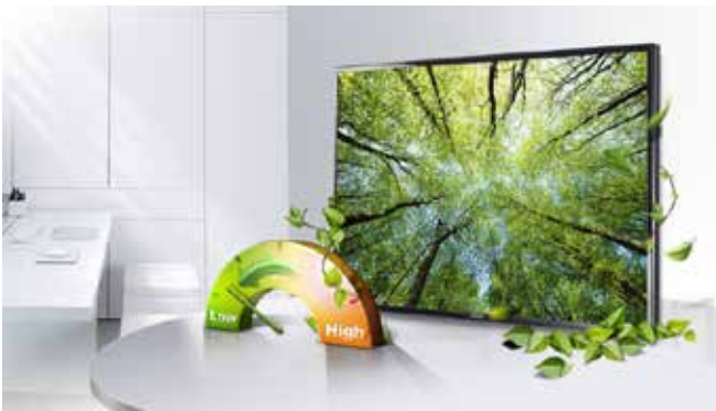
Figure 7. Samsung LED backlight technology uses less power for optimal energy efficiency.

For UDC and UEC Series screens, Samsung technology offers a dimming solution that generates deeper black tones by controlling the LED BLU (backlight unit). The overall picture quality of the displays is heightened, providing a sharp and vibrant image. The backlight dimming technology reduces costs by consuming 40 percent less power than CCFL LCDs, based on an internal Samsung test. The technology is also free of harmful materials, such as mercury or halogen, contributing to a cleaner environment.