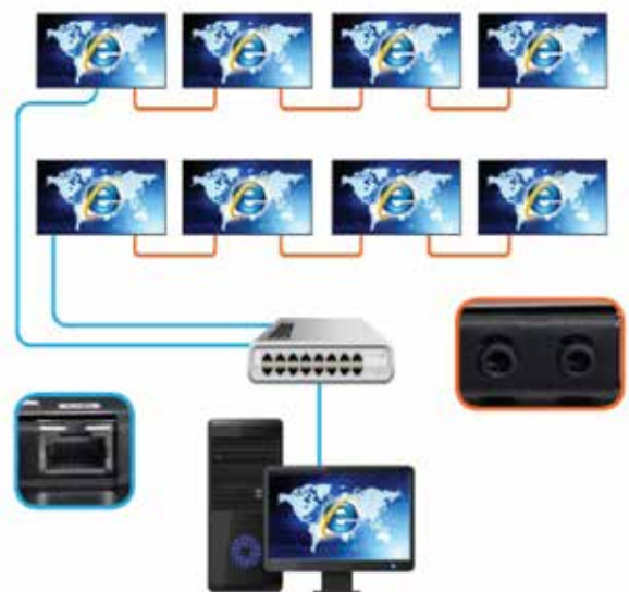
Figure 11. UDC and UEC Series displays enable RJ45 and RS-232C connectivity simultaneously.

The UDC and UEC Series displays offer powerful connectivity, even when working with registered standard jacks (RJ45) and recommended standard cables (RS-232C) connections. Both network connections can be used simultaneously. Using a digital visual interface (DVI) loop out, a single display image can be shared with nearby displays. This feature eliminates the need to purchase separate video signal distributors for each display, further reducing equipment costs.