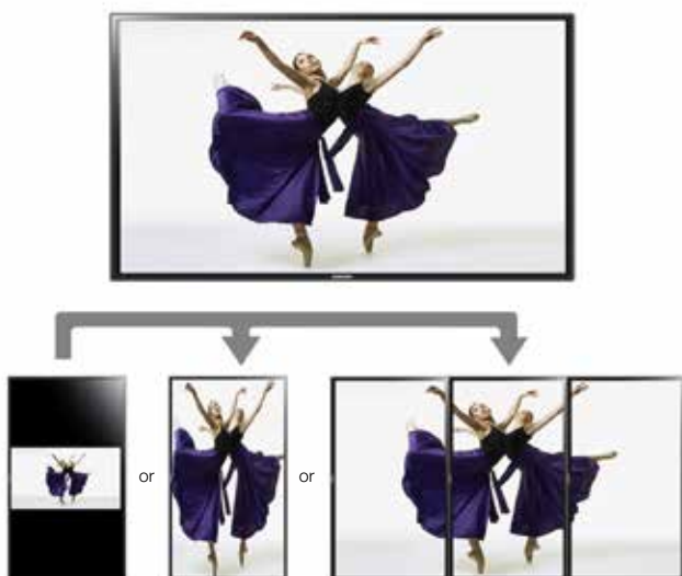
Figure 10. Portrait to landscape image rotation enhances usability with no loss of resolution.

The UDC and UEC Series displays offer Auto Image Rotation, providing image orientation rotation from portrait to landscape for greater display flexibility. For convenience when rotating the image, two resolution options are available: original resolution or auto full-sizing resolution. Image quality is preserved when the images are rotated, with no loss of resolution.