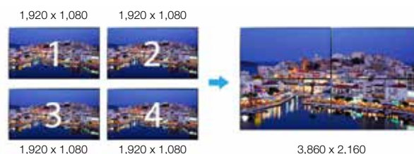
Figure 6. UDC and UEC Series displays offer UHD resolution of 3,860 x 2,160 for a 2 x 2 wall.

Additionally, the UDC and UEC Series displays offer ultra high definition (UHD) resolution through DP 1.2 multistreaming. A video wall of up to four units (2 x 2) can have UHD resolution multistreaming without additional equipment.