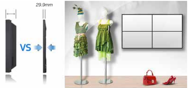
Figure 8. Displays can be installed in narrow areas.

The narrow depth of the UDC, UDC-B and UEC Series of displays is designed to enable placement in tight areas, such as behind counters and display cases. The UDC and UDC-B models offer slim profiles of 96 mm (3.78 in.) and the UEC model features a depth of only 29.9 mm (1.18 in.).